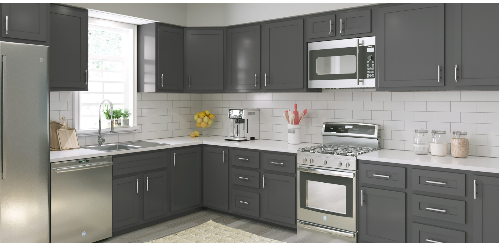
Shaker Classic Graphite

CHOOSE THE PERFECT DOOR STYLE, COLOR, AND ACCESSORIES FOR YOUR CABINET TRANSFORMATION