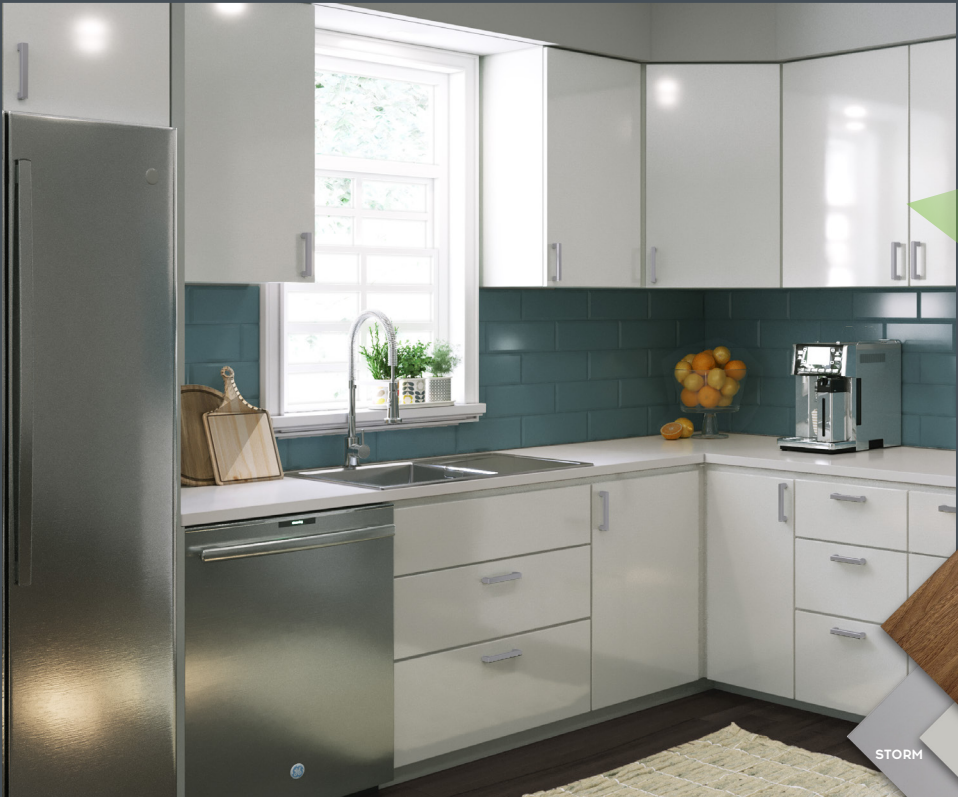
Snow Gloss Slab

SLAB: A clean, modern look available in 9 colors and a primed-for-paint option.