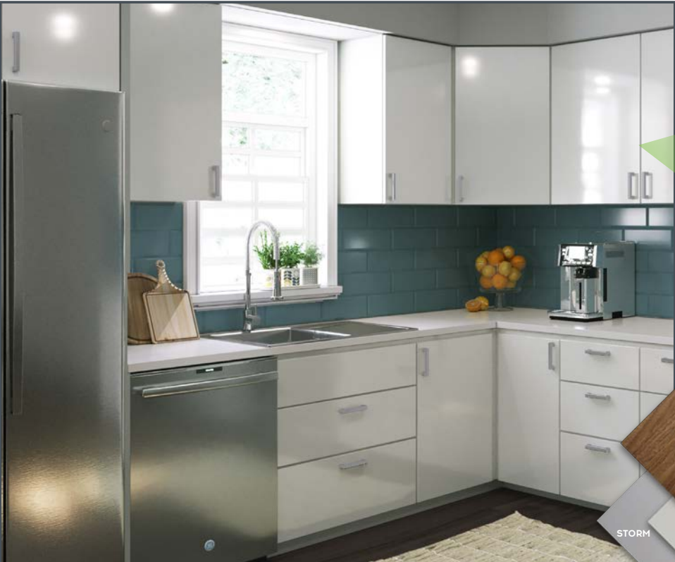
Snow Gloss Slab

SLAB: A clean, modern look available in 7 colors and a primed-for-paint option.