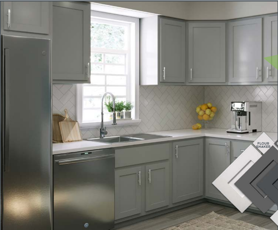
Shaker Fusion Storm

FUSION: Slab drawer fronts in combination with 5-piece door fronts.