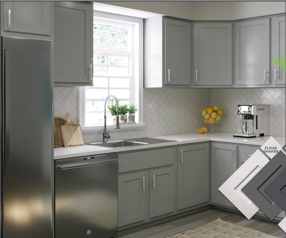
Shaker Fusion Storm

FUSION: Slab drawer fronts in combination with 5-piece door fronts.