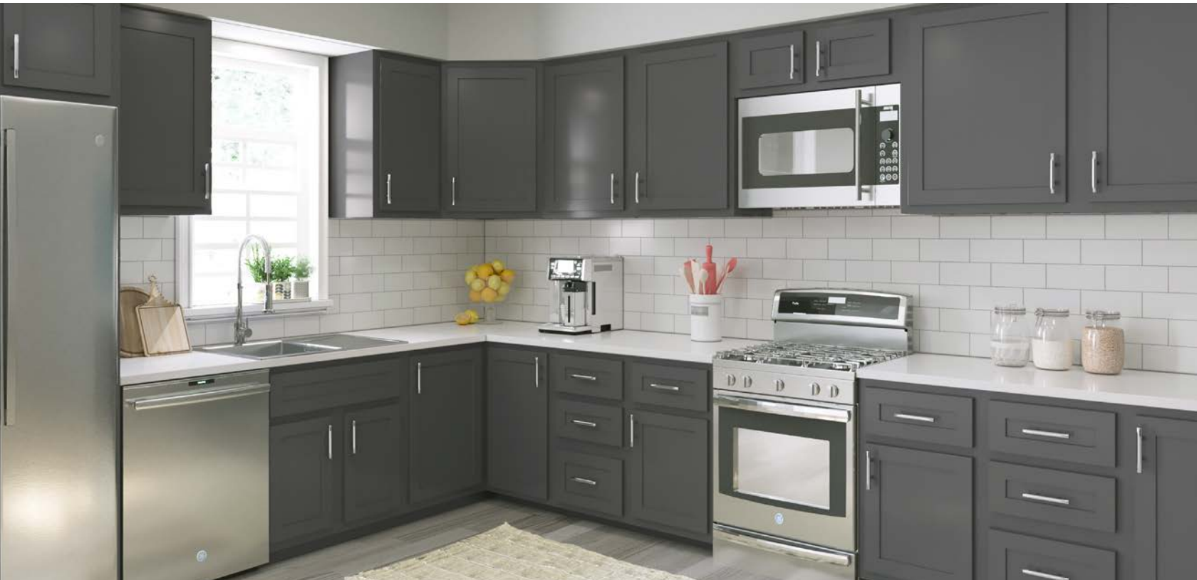
Shaker Classic Graphite

CHOOSE THE PERFECT DOOR STYLE, COLOR, AND ACCESSORIES FOR YOUR CABINET TRANSFORMATION