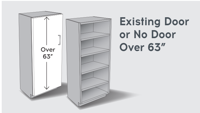
Existing Door or No Door Over 63"