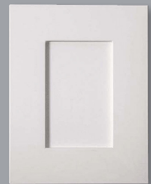
Paint Ready Shaker Classic